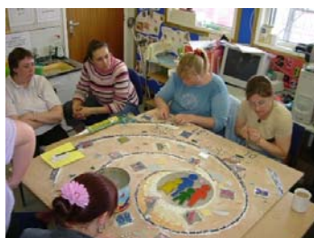
Mosaic Group Mount Wise in Progress